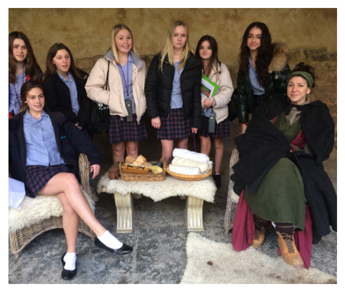
Unfortunately, the eagerly anticipated trip to Rome and the Bay of Naples that was due to take place in March 2020 had to be cancelled due to the global pandemic. However, we look forward to taking students to visit Rome in the future.

The weekly Classics club continued to thrive, providing opportunities for students to develop their creative skills, for example creating Roman buildings such as the Colosseum, making mythological characters out of clay and designing their own mosaics.