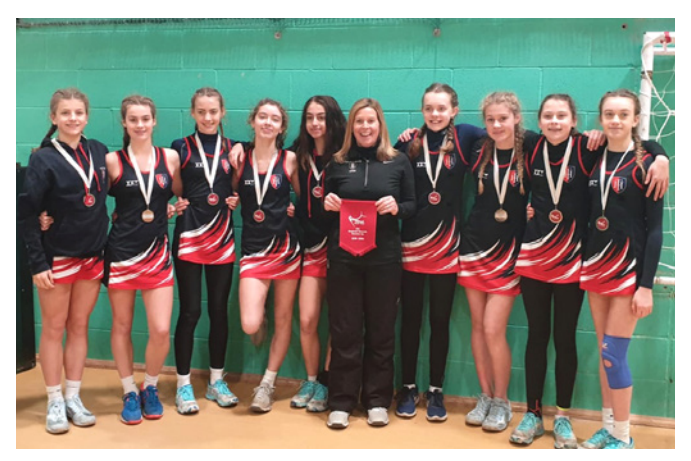
to the parents for their continued support at events and fixtures. It has been a fantastic year in both achievement and enthusiasm,.

I'd like to thank our students for their hard work and commitment, and fantastic contribution to school sport. I have been amazed by the dedication and drive that Talbot Heath students have demonstrated under such unusual circumstances. Thanks also go